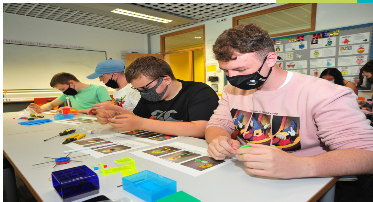
Year 10 learners enjoying a STEM Taster Day